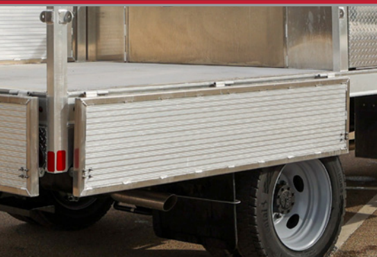
Fold Down Sides