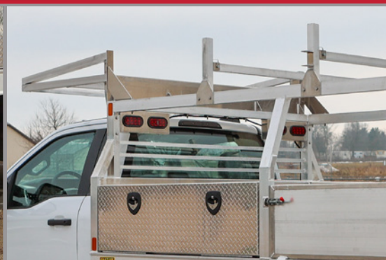
Aluminum Ladder Rack