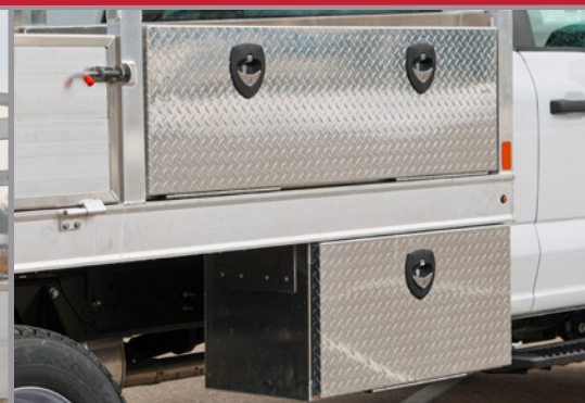
Secure Tool Boxes