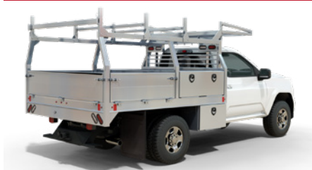
TradesPRO® | Elite